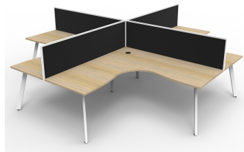
Natural Oak Top White Satin Frame