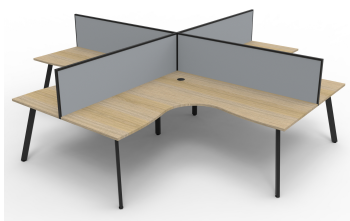
Natural Oak Top Black Satin Frame