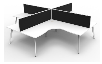
Natural White Top White Satin Frame